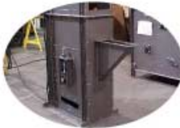
▲ Unit infeed design.