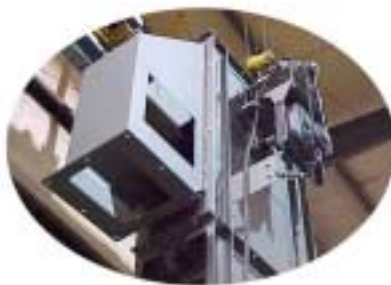
▲ Discharge of unit with anti-runback arrangement.