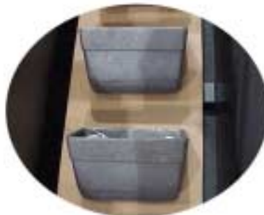
▲ Buckets are bolted to belt or chain.