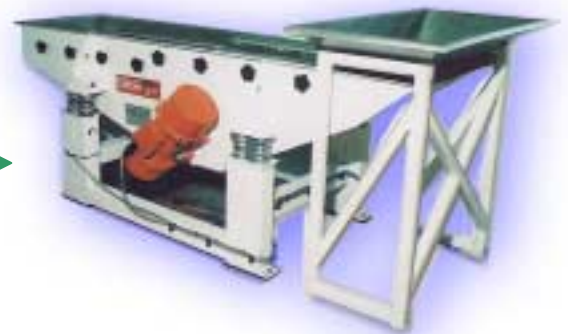
De-dusting conveyor powered by contra-rotating motors to remove excess sugar from jellied sweets.