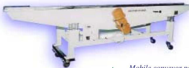
Mobile conveyor powered by contra-rotating vibrator motors handling tortilla chips.